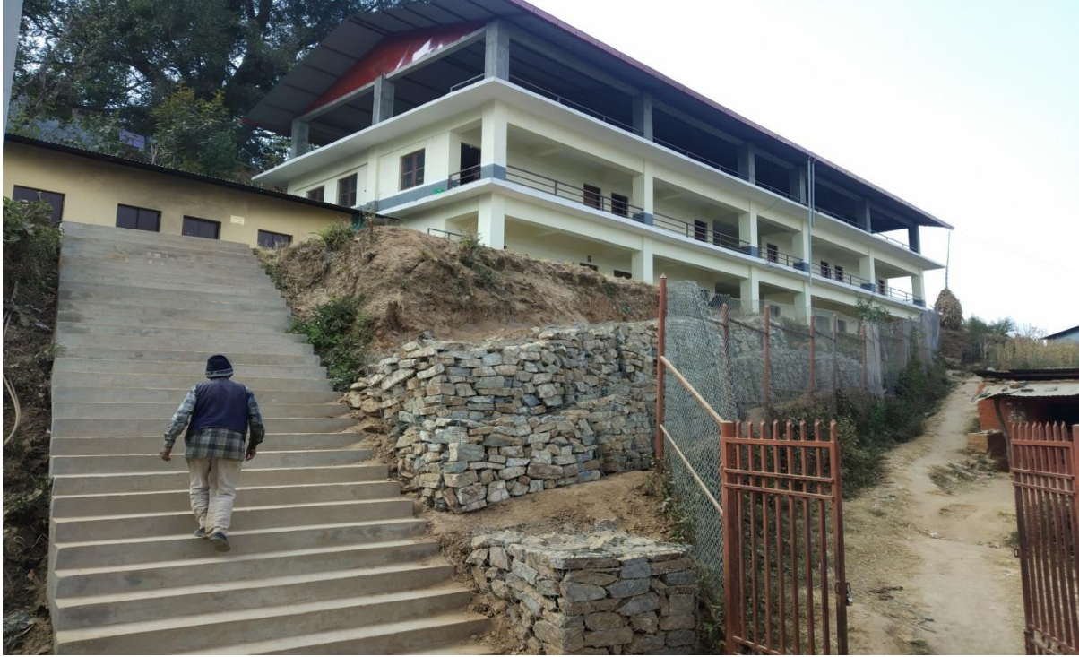
Completed the wall step construction project -